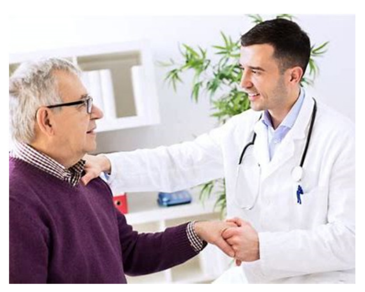
Strategies and goals

The design will lift the spirits of those in the clinic both helpers and patients. The music the odor the colors and the shape of the space will foster beauty serenity peace calm and a sense of healing. Plant life and fish add to this sense of belonging to one ecosystem.